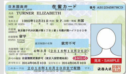
(Residence Card SAMPLE)

★ Ministry of Justice, Immigration Bureau homepage http://www.immi-moj.go.jp/