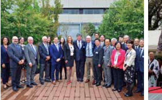
Maple tree Planting Ceremony at the roof top garden

Courtesy call, attending Welcome and Tree Planting Ceremonies, participating in the Itabashi Residents Festival, traditional culture experience and city tours, etc.