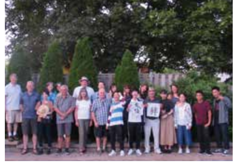
Together with host families