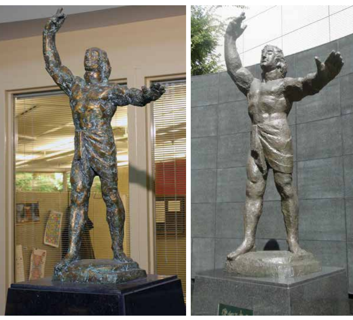
Courtyard of Burlington City Hall