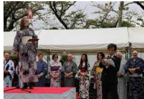
Participated in Itabashi Residents Festival